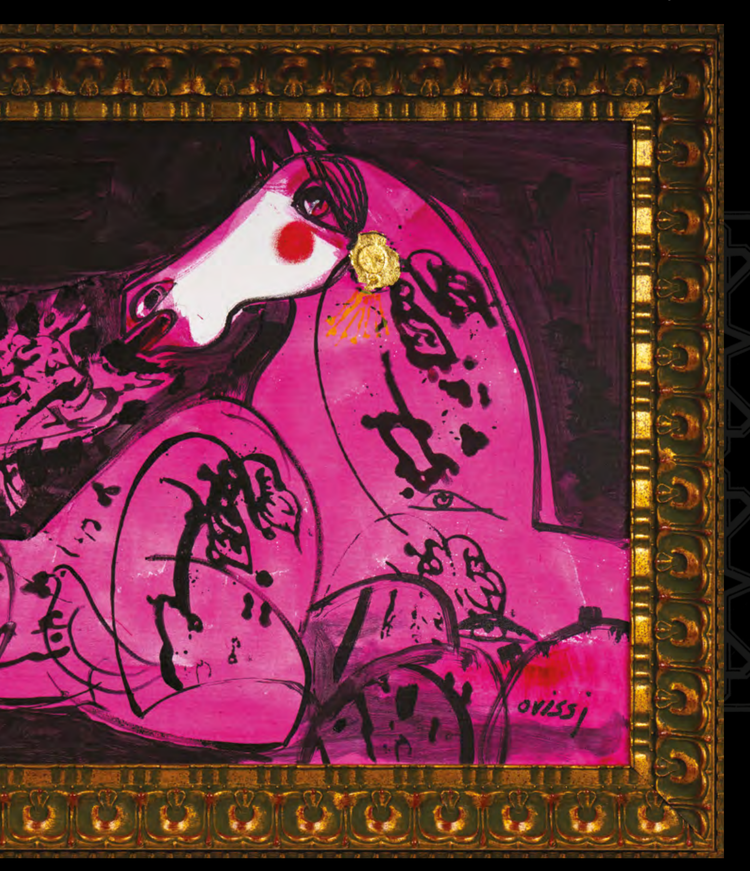
experience my work will walk away with an experience of Beauty."