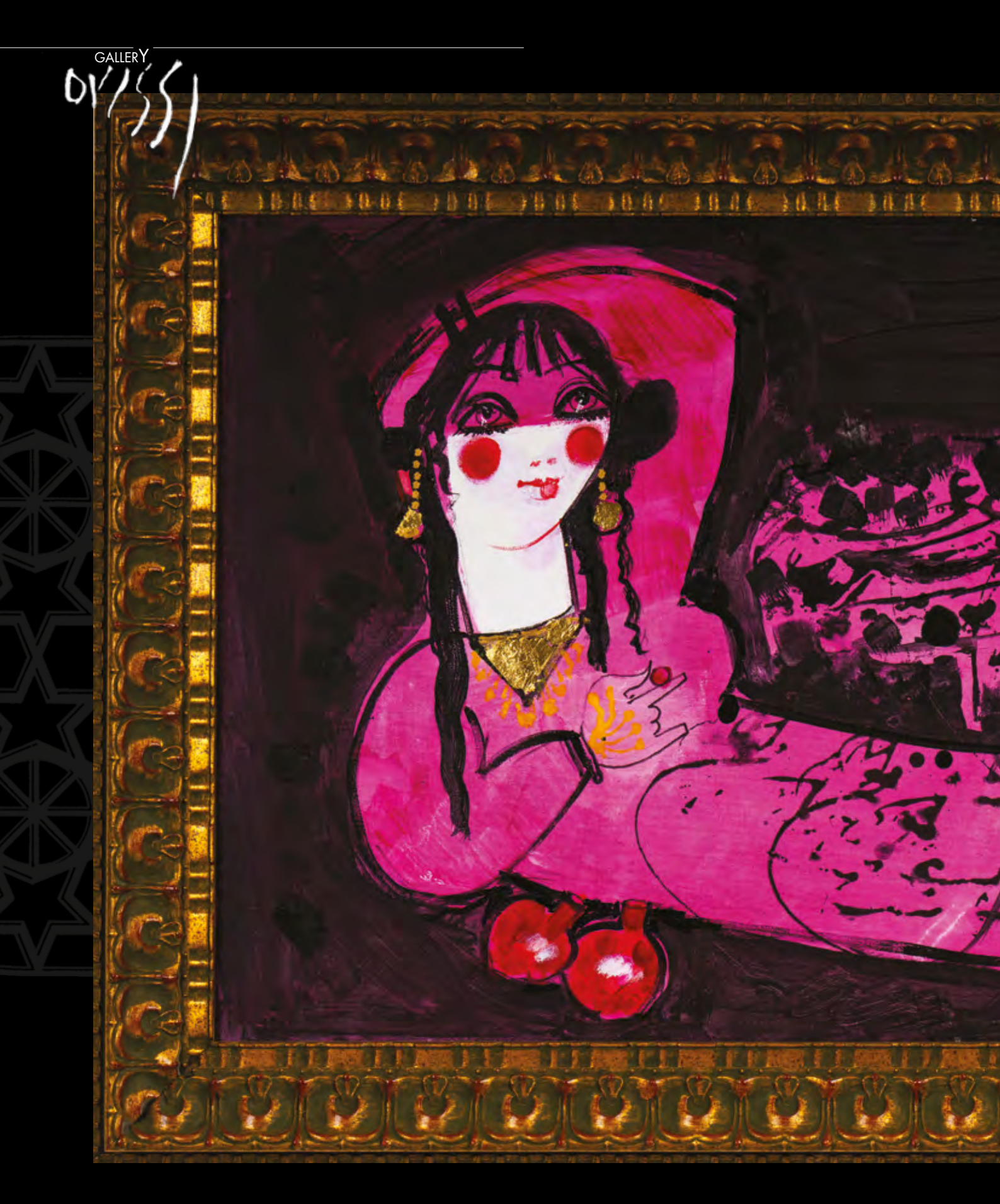
"My work is dedicated to the beauty of life and I hope those who